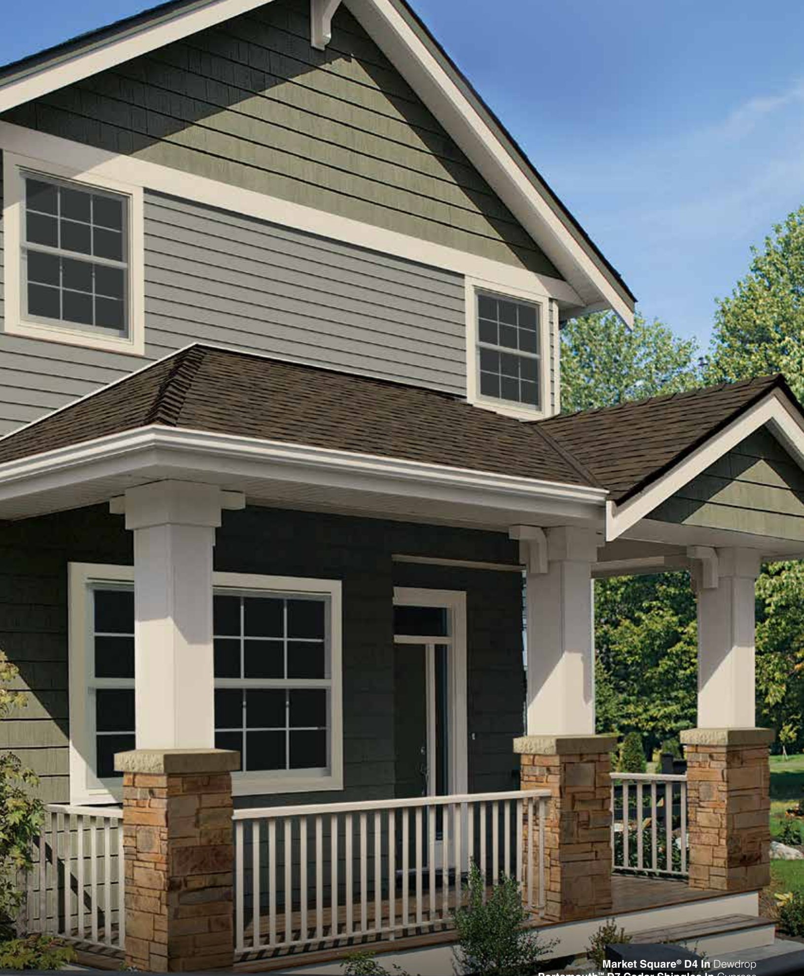
Market Square® D4 In Dewdrop Portsmouth™ D7 Cedar Shingles In Cypress Exterior Portfolio® Vinyl Trim In Country Beige