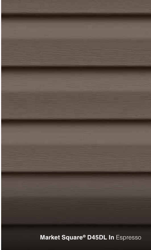
Market Square® D45DL In Espresso