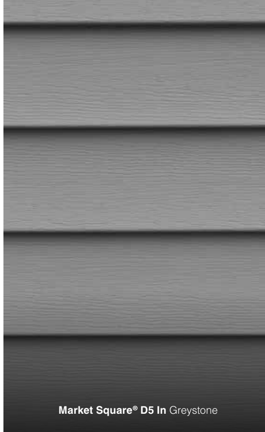
Market Square® D5 In Greystone