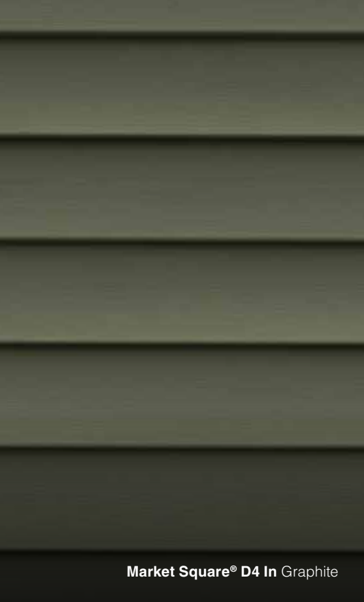
Market Square® D4 In Graphite